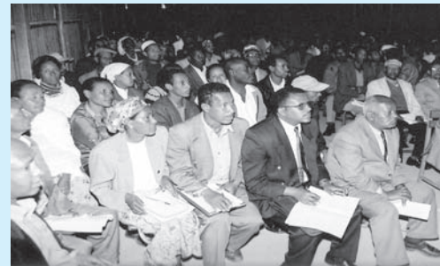
Picture 10.2. Development committee leaders meeting