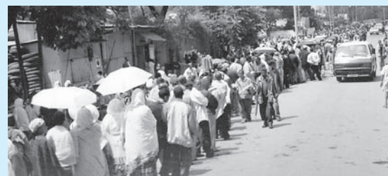
Picture 10.3. Democratic Election