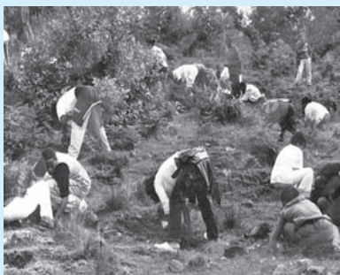
Picture 10.1. People planting trees