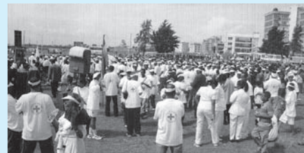
Picture 10.6. Annual Red Cross and Red Crescent Day